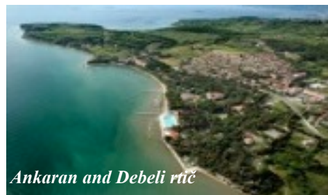
Adria –Ankaran touristic complex near Koper